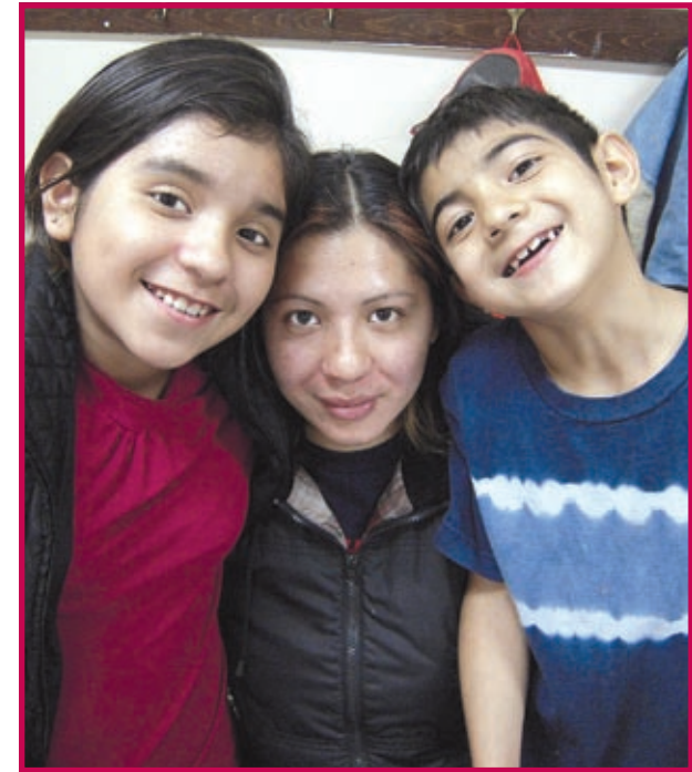
"Our whole family thanks you for your donations to the South Plains Food Bank."